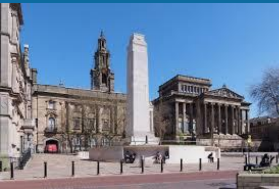
Where opportunity creates success

Its rugged coastline studded with gold sand beaches and secret coves, to rolling countryside dotted with patchwork fields and crops of ancient woodland, to vertiginous peaks set above glistening meres and heather-clad moors, via kitschy seaside resorts, pretty-as-a-postcard villages and handsome market towns, there's no shortage of places to visit in the United Kingdom.